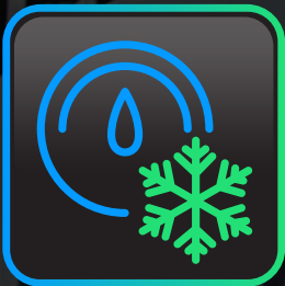
Freezing Temperature -0.4°F / -18°C