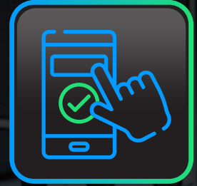
QR Code Payment