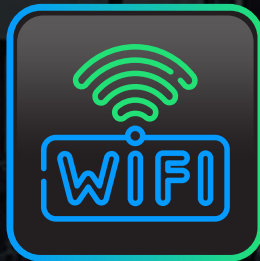
5G/4G wifi LAN Port