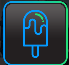
Capacity 125-260 pcs